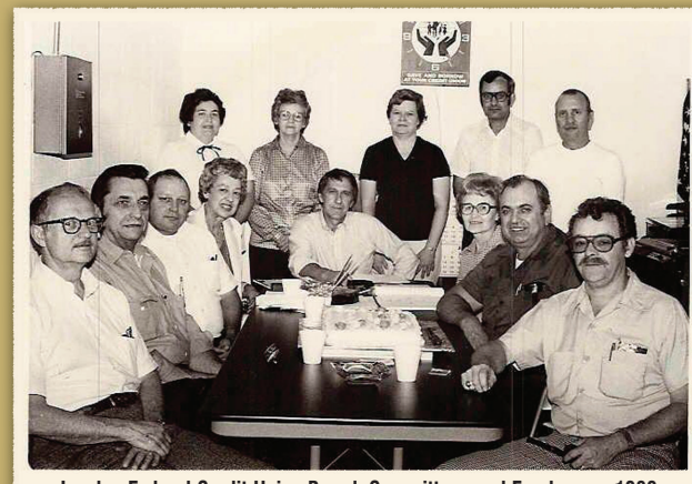
Loudon Federal Credit Union Board, Committees and Employees, 1980

6 P.M. Registration and Dinner 7 P.M. Short Meeting